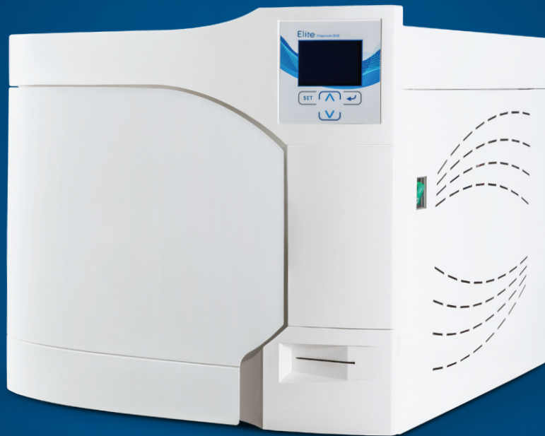
Elite Premium B18/24

QUALITY & ADVANCED TECHNOLOGY PROVIDE FULL FACILITIES AS YOU DESIRED